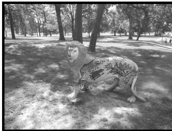
Flynn Park, established 1923

A Federal court has struck down Missouri's Second Amendment Protection Act, which became law two years ago. It said that Federal gun laws did not apply in Missouri. Attorney General Ash-